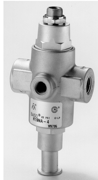
Figure 1: H19 High Pressure Safety Pilot Valve

The H19 Series BASO® high pressure safety pilot valves are designed for commercial and industrial applications with gas pressures of up to and including 25 psi (1.72 bar [172 kPa]). The H19TB high temperature model is available for gas pressures at 15 psi (1.03 bar [103 kPa]). Applications include industrial heaters, crop dryers and similar appliances.