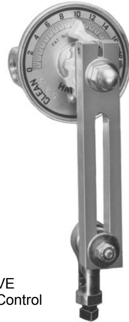
S VALVE Automatic Control