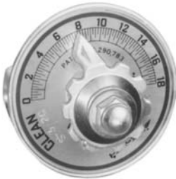
S VALVE Manual Control