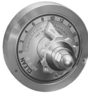
AS VALVE Manual Control