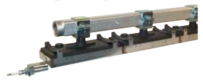
Side view - Type 25 assembly