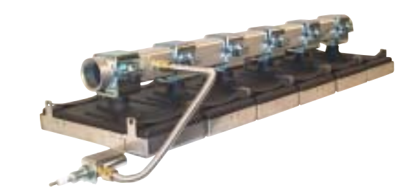
Rear view - Type 50 assembly